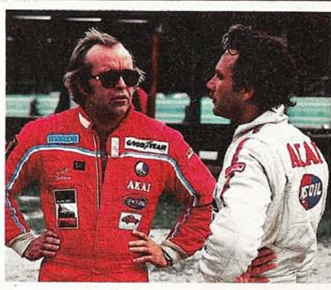
AMSOIL/AKAI MAZDA RX-7

With this machine, Racing Beat has shattered any doubts about its ability with rotary road racers. It has truly attained the always desired, seldom achieved overdog status, and it's a good bet that Mazda will continue its sponsorship next year to keep the RX-7 onslaught rolling. But Racing Beat is ready for more ambitious rotary possibilities. In the GTO class, the larger, 1.3-liter engine with some combination of lower weight, fuel injection, and turbocharging might be just the ticket. GTP is another possibility, but high minimum weight and large minimum frontal area could offset the rotary's inherent advantages. Rumors are afloat, however, of a midship-engined pure race car with two rotary noise generators. They would provide enough horsepower, and four fire-breathing nostrils would make it the fastest dragon around. The red and yellow inks at our printing plant are ready and waiting. -Csaba Csere